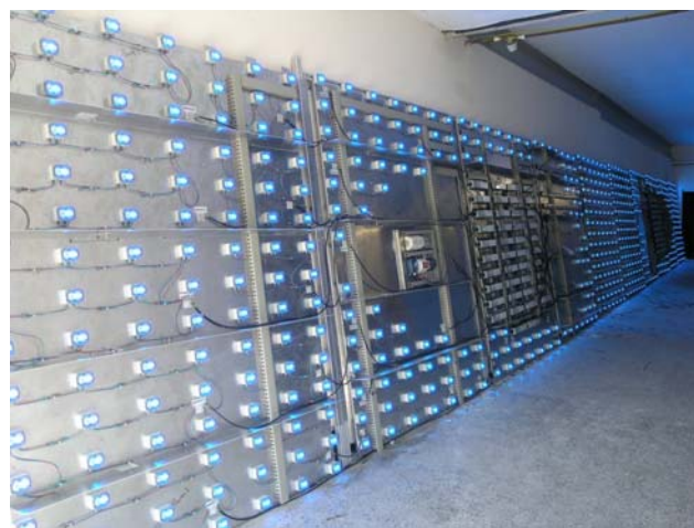
The workings of the LEDs and drivers, and the installing into the underpass