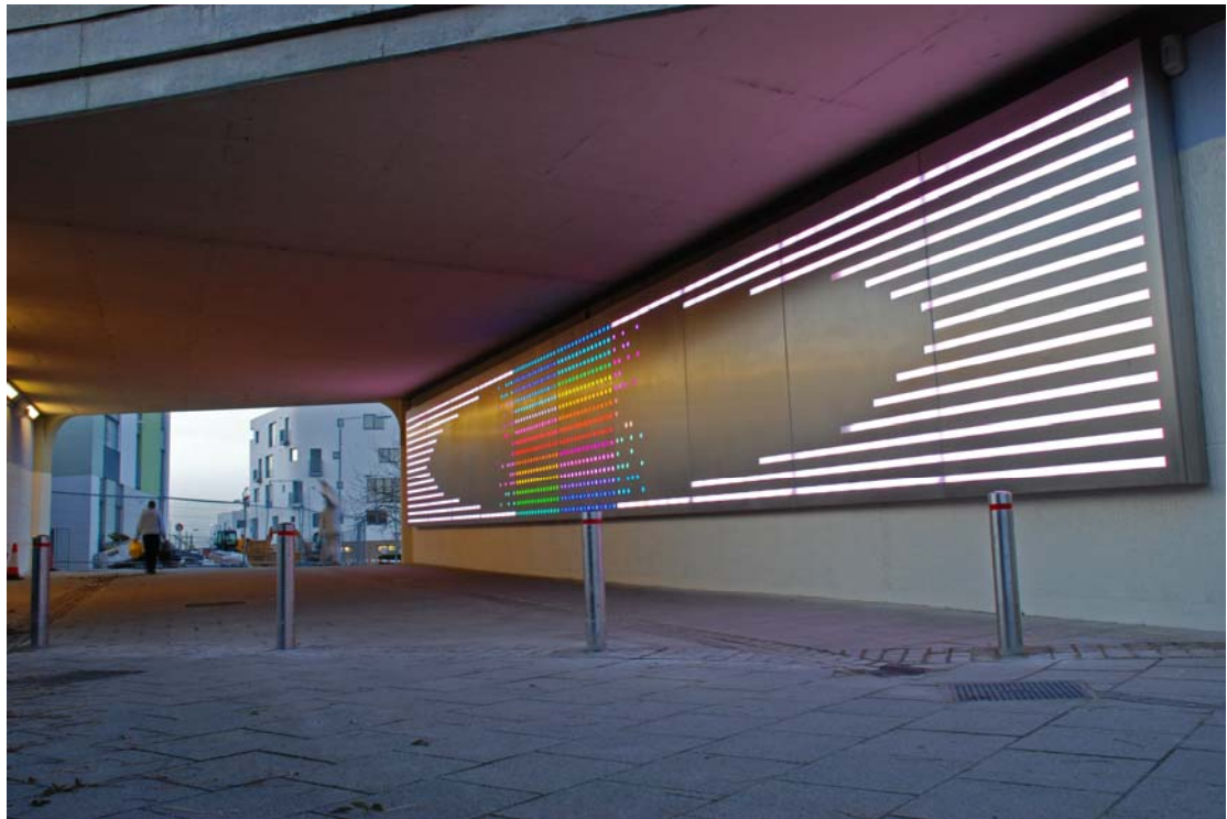
Light waves fully installed November 2006