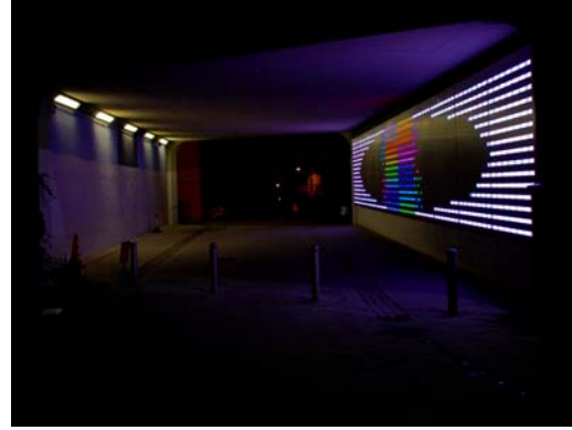
Light waves fully installed November 2006