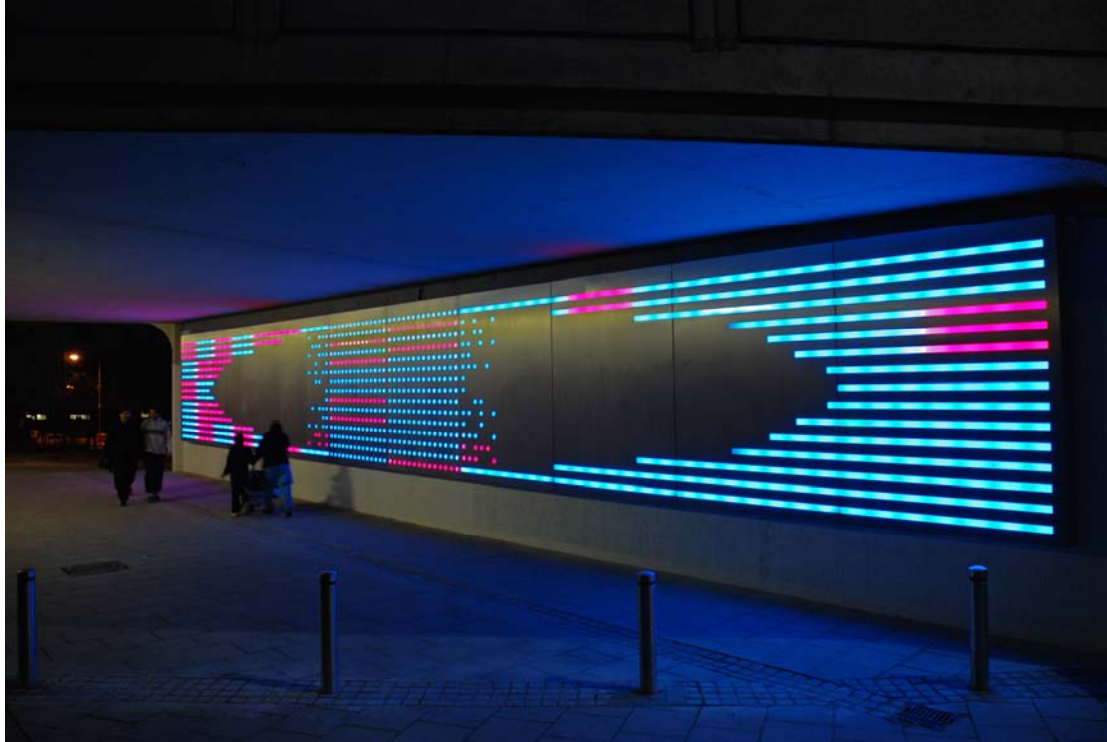
Light waves fully installed November 2006

'When you enter the underpass a sensor is triggered your movement and pulses of light from both ends follows you to the centre of the underpass then setting of the middle circles' The design involves a schematic eye shape: 'I wanted to have a sense of light following you through the underpass. When there are no moving subjects the whole artwork will be a slow and subtle spectrum of colour changing.